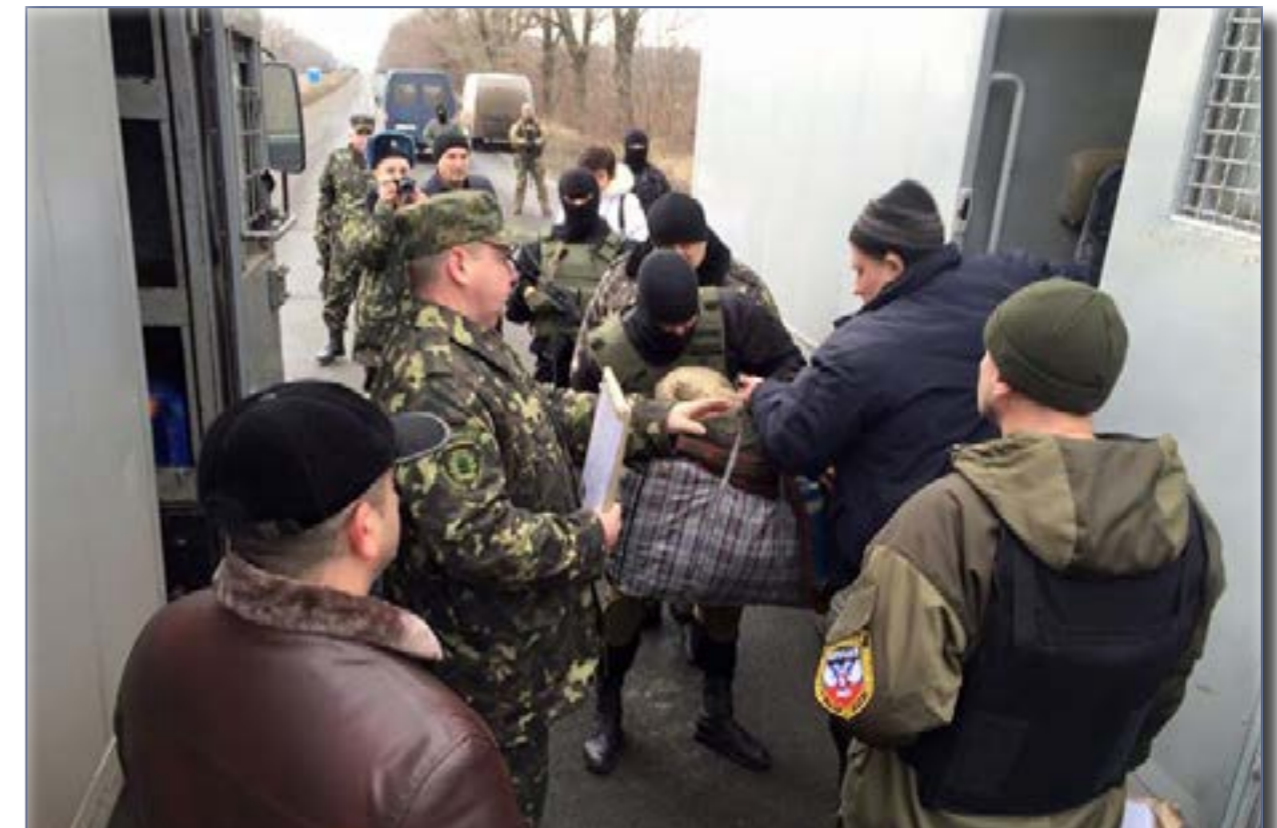
During the transfer of convicted persons from Non-government controlled areas of Donbas