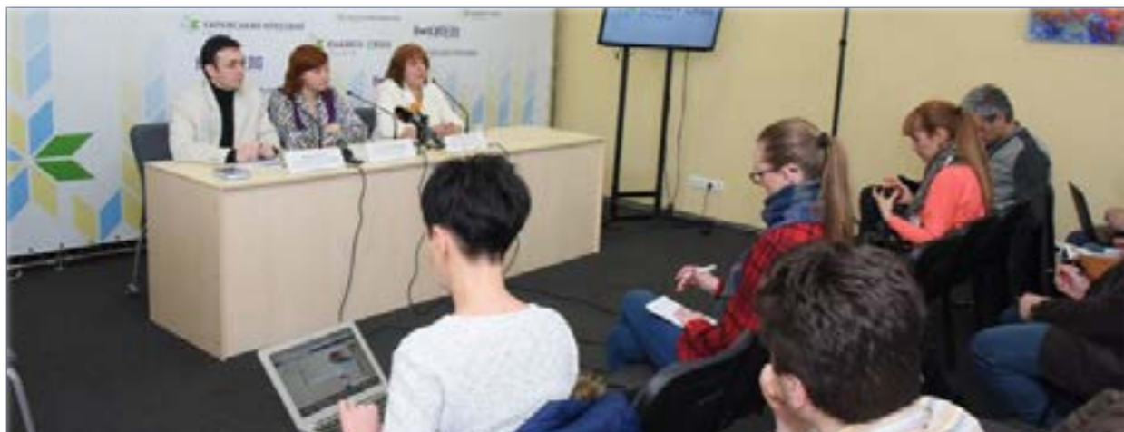
Press-conference in Kharkiv