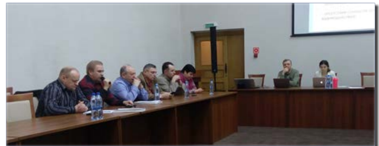
Presentation of results of campaign "Police under Control" in Minsk