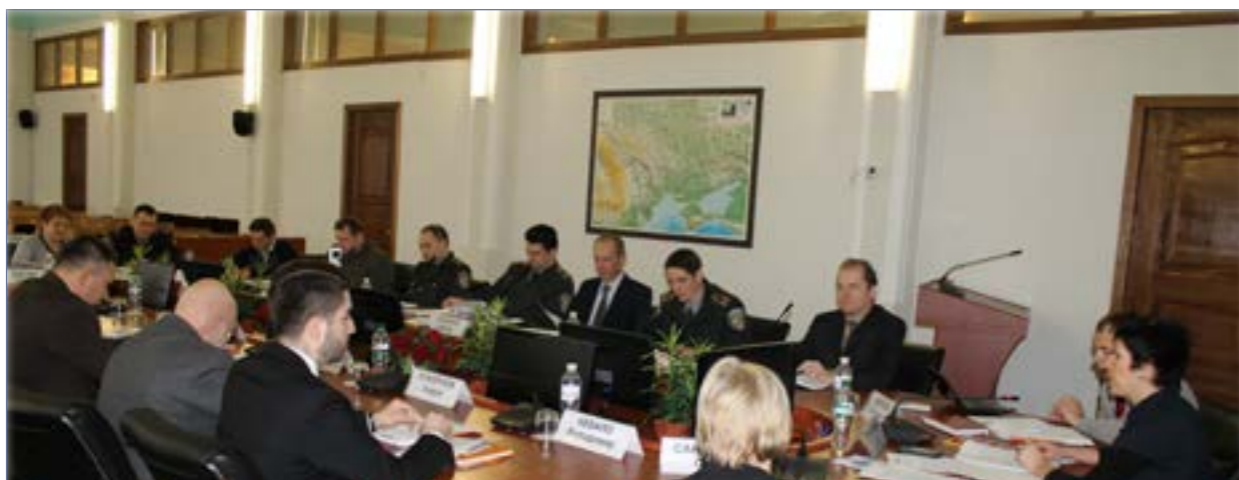
During the meeting of the Coordination Committee on Support for the Penitentiary Reform in Ukraine