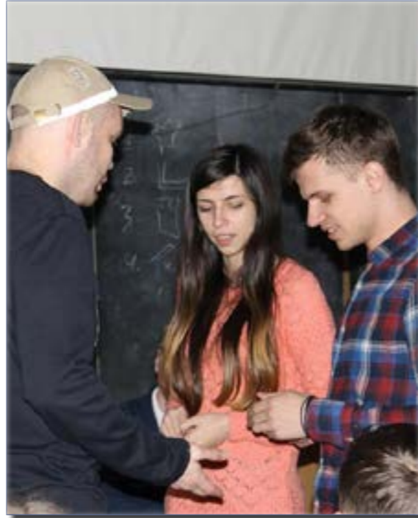
Master-class for youth