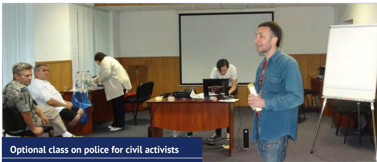
Optional class on police for civil activists