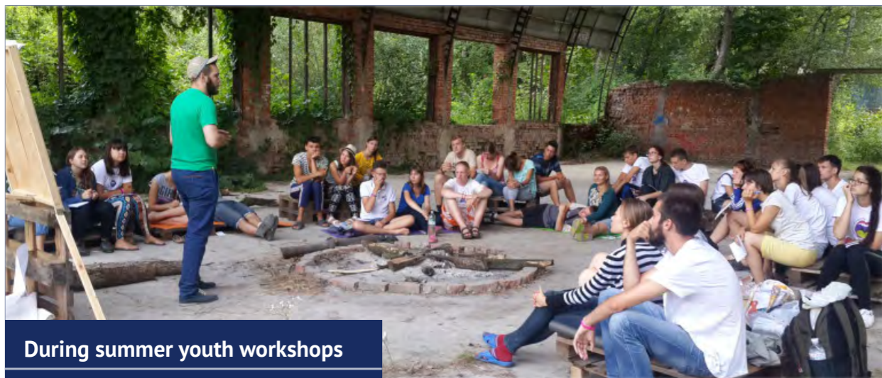
During summer youth workshops