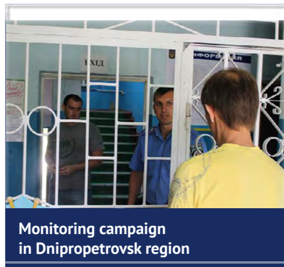
Monitoring campaign in Dnipropetrovsk region