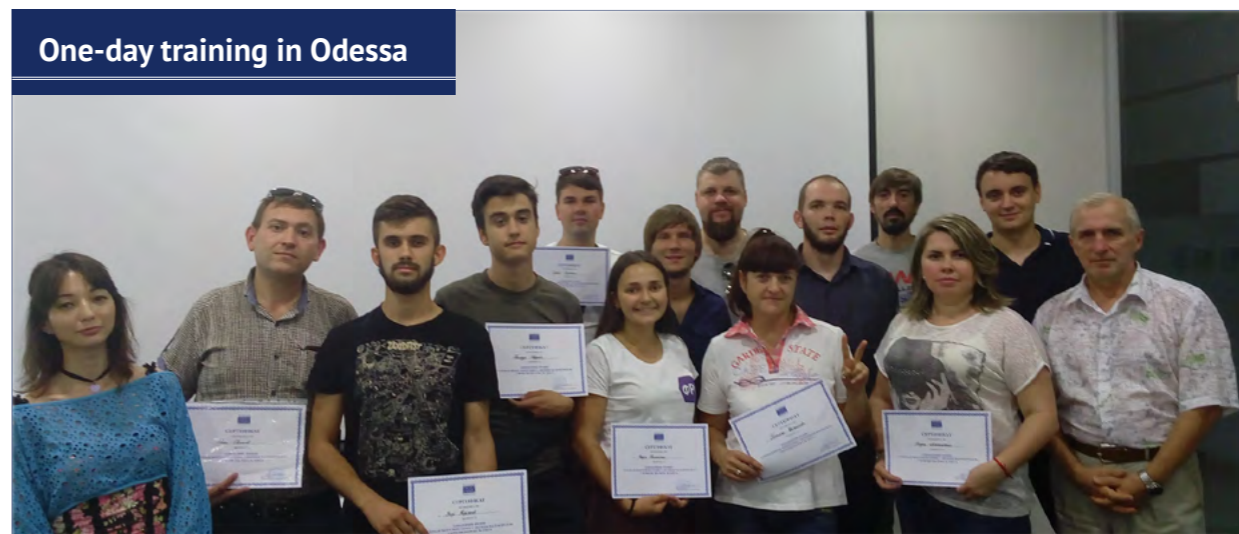
One-day training in Odessa