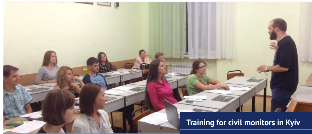
Training for civil monitors in Kyiv