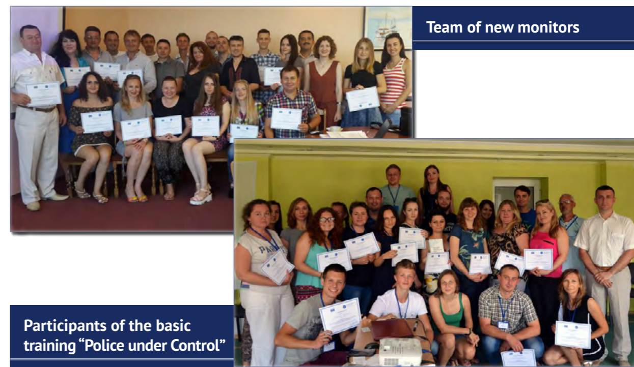
Team of new monitors