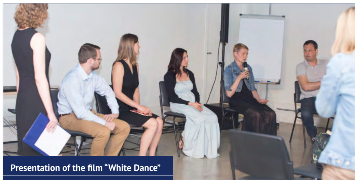
Presentation of the film “White Dance”